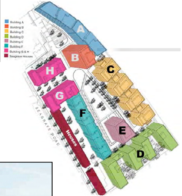
(RIGHT) The current proposal, with Buildings A to D facing the western side of Brompton Cemetery. "Seagrave Road will provide 808 new homes spread across eight new buildings designed as a series of modern mansion blocks and town houses. They will be linked by new streets, a large garden square and a variety of courtyard gardens." ( Seagrave Road Planning Application Summary, August 2011 )

The cemetery lies within the Royal Borough of Kensington and Chelsea (RBKC), the Seagrave Road site within the London Borough of Hammersmith and Fulham (LBHF).