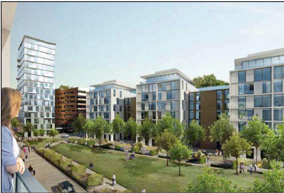
(LEFT) Artist's impression of the view from Building F toward Buildings B and C, and the green space in the centre of the development ( Seagrave Road Planning Application Summary, August 2011 )