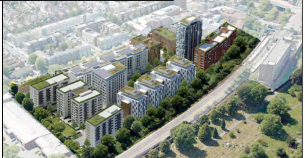
(RIGHT) Artist's impression of the proposed complex from an aerial perspective, with the railway and cemetery to the west, Earls Court 2 exhibition centre and the Empress State Building to the north