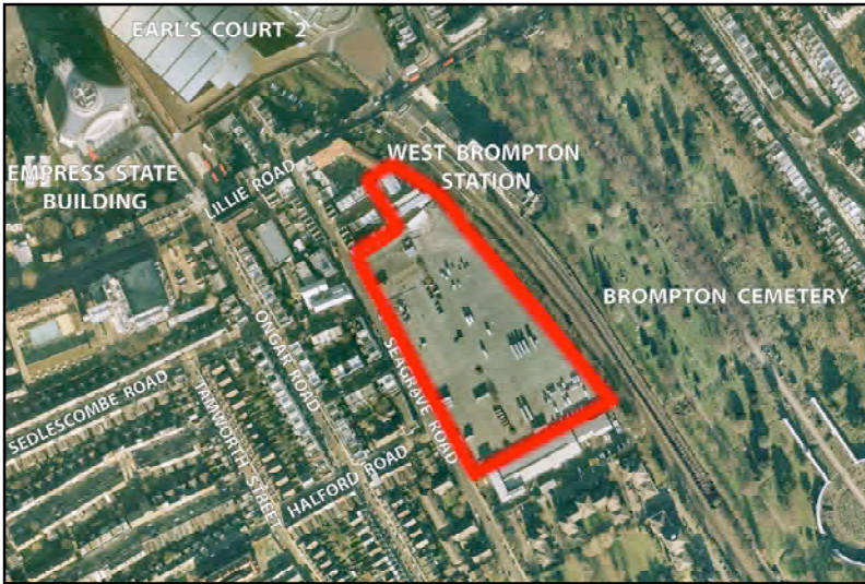
(LEFT) Satellite view of the Seagrave Road parking lot, Brompton Cemetery, Earls Court 2 exhibition hall and the Empress State Building.

The cemetery lies within the Royal Borough of Kensington and Chelsea (RBKC), the Seagrave Road site within the London Borough of Hammersmith and Fulham (LBHF).